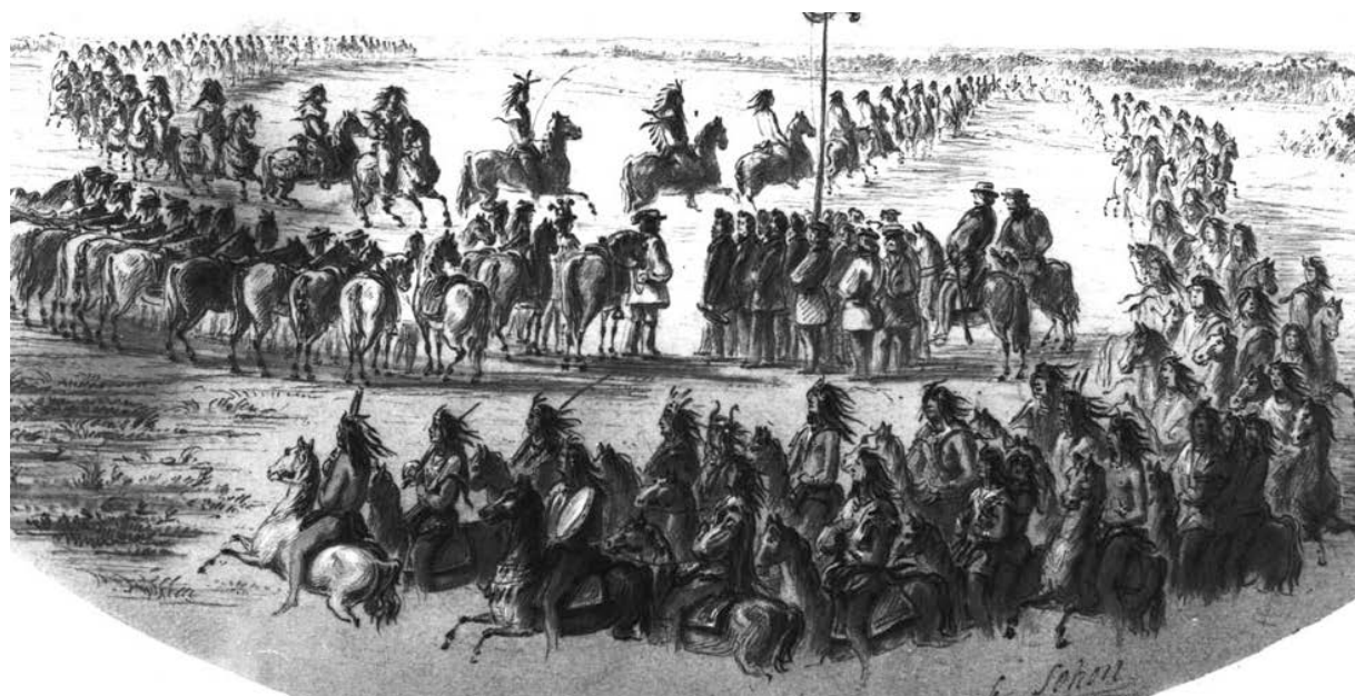
Nez Perce arriving at the Treaty Council Grounds

Key excerpts from the official record of the council proceedings, including statements by Stevens, Palmer, and each of the Indian leaders who spoke, are available at www.wallawallatreatycouncils.blogspot.com .