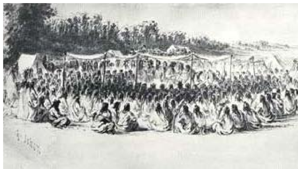
Official Proceedings of the Council