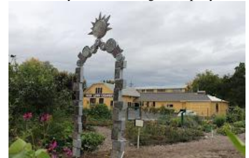
Shady Lawn Antiques across Sumach from the Garden

The Walla Walla Creamery, now Shady Lawn Antiques, was established in 1889 by the Walla Walla Creamery & Cold Storage Company