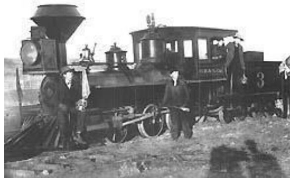
The Blue Mountain engine ran on this track in 1881

One of the three narrow gauge engines used on this line was the Blue Mountain, built in Pennsylvania in 1878 for the Walla Walla and Columbia River Railroad. The engine was sold to Mill Creek Flume & Manufacturing Company for use on Mill Creek in 1881. After service with the Oregon Railway & Navigation Company from 1887-1890, the Blue Mountain returned to service on the Mill Creek flume line in 1894, and was used here until 1905 when the Northern Pacific ended narrow gauge operations in the area. After service in Alaska, the Blue Mountain returned to Walla Walla in 1992 where it was put on display at Baker Boyer Bank. It is now being restored for display at Fort Walla Walla Museum.