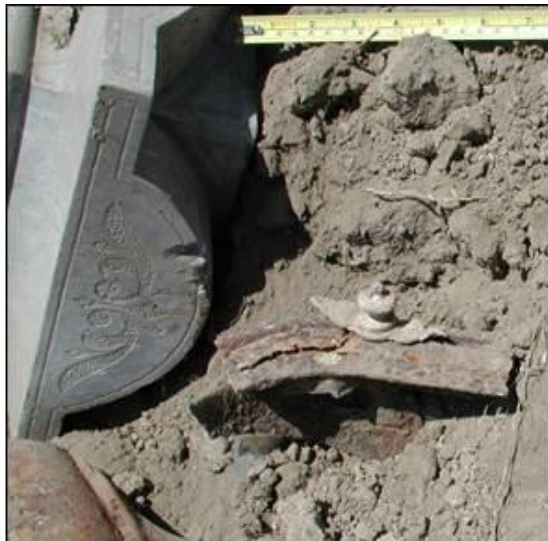
CTUIR photo of gravestone and coffin hardware displaced after area construction