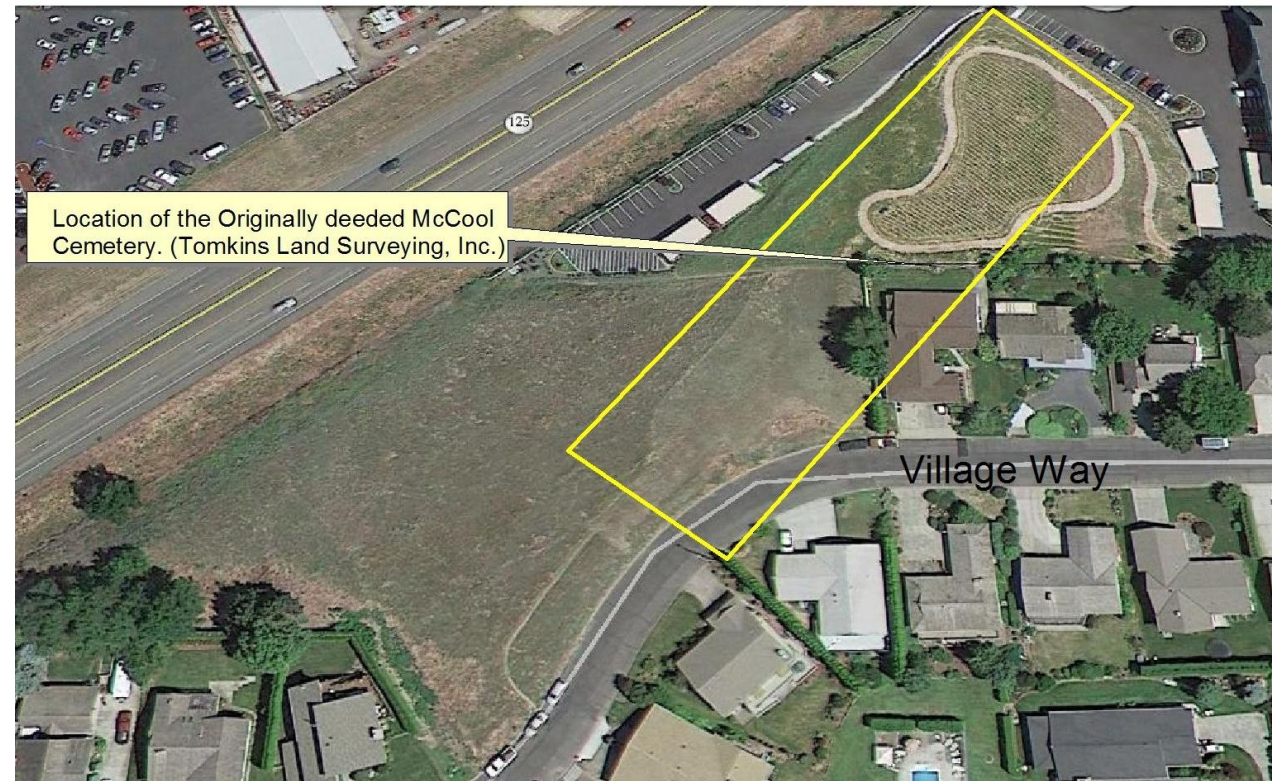
2013 aerial view with superimposed 2003 survey of the original boundaries of the McCool Catholic Cemetery