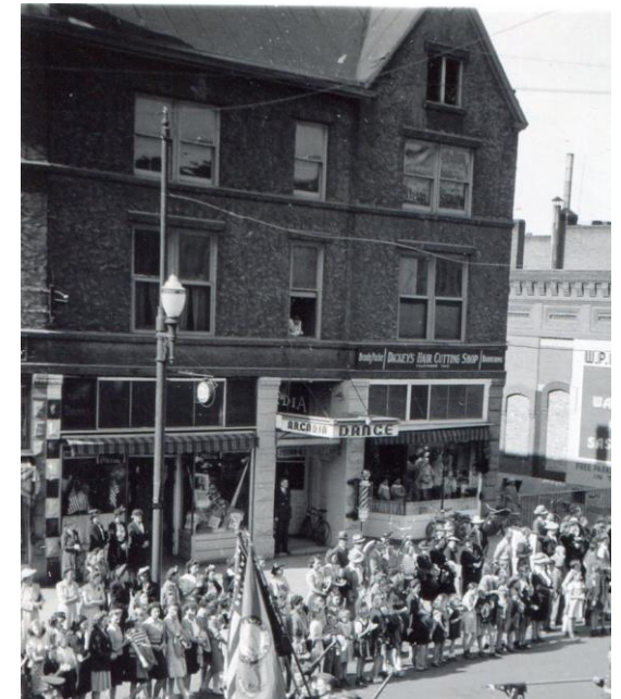
Arcadia Ballroom in the old Armory Building